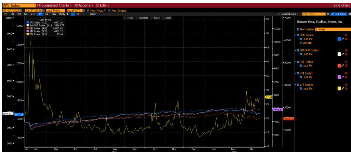
Chart of the Week

European equities have shown relative resilience, though the continent’s exposure to energy disruption via LNG supply chains remains a latent risk.